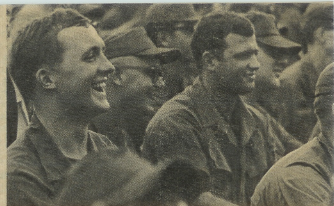
The jokes were funny, too.