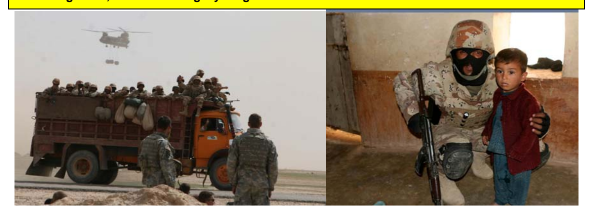
WINGS OF DESTINY MAGAZINE * 101ST AVIATION BRIGADE * 6

The Iraqi Army at work during Operation Swarmer (clockwise from top left): searching outside a home, detaining a suspect, giving children candy, riding in a truck at the Forward Arming and Refueling Point, and comforting a young child in one of the searched homes.