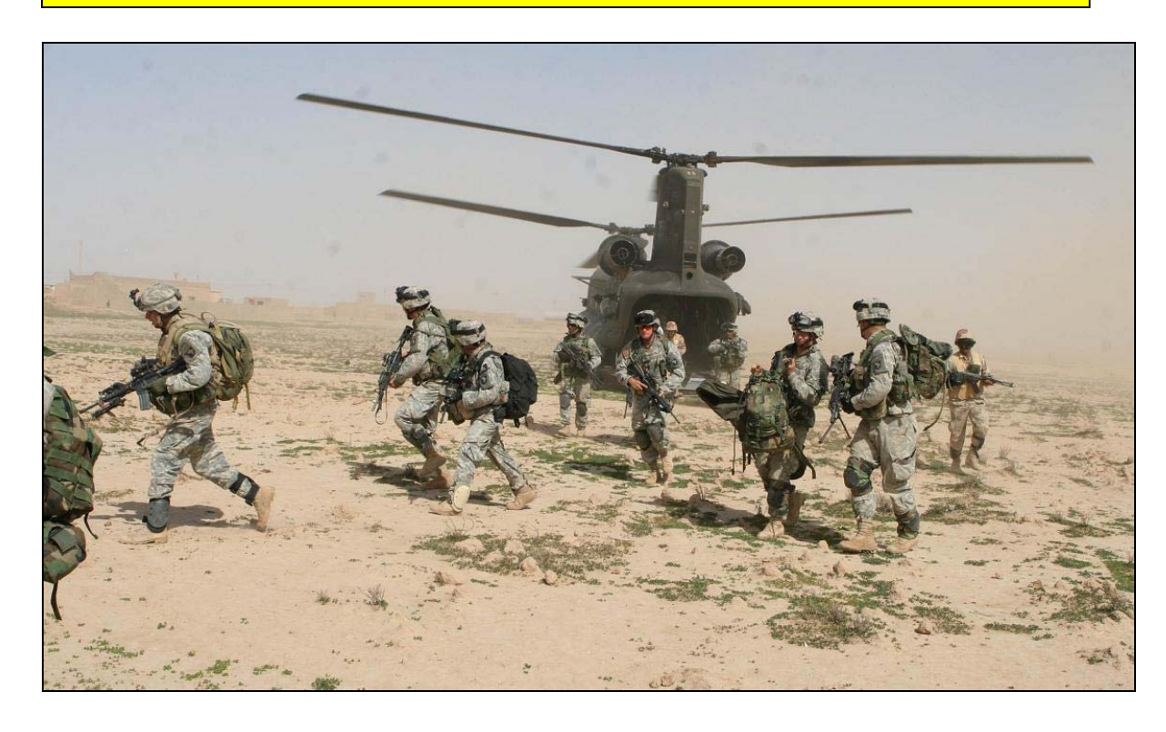
WINGS OF DESTINY MAGAZINE * 101ST AVIATION BRIGADE * 7

U.S. and Iraqi Army Soldiers get on a 5<sup>th</sup> Battalion, 101<sup>st</sup> Combat Aviation Brigade Blackhawk (above), and off a 6<sup>th</sup> Battalion, 101<sup>st</sup> Combat Aviation Brigade Chinook (below.)